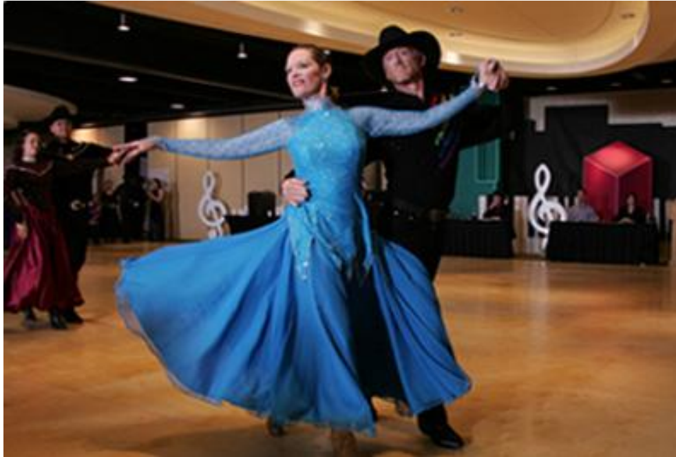
Couple in a Country Western competition.