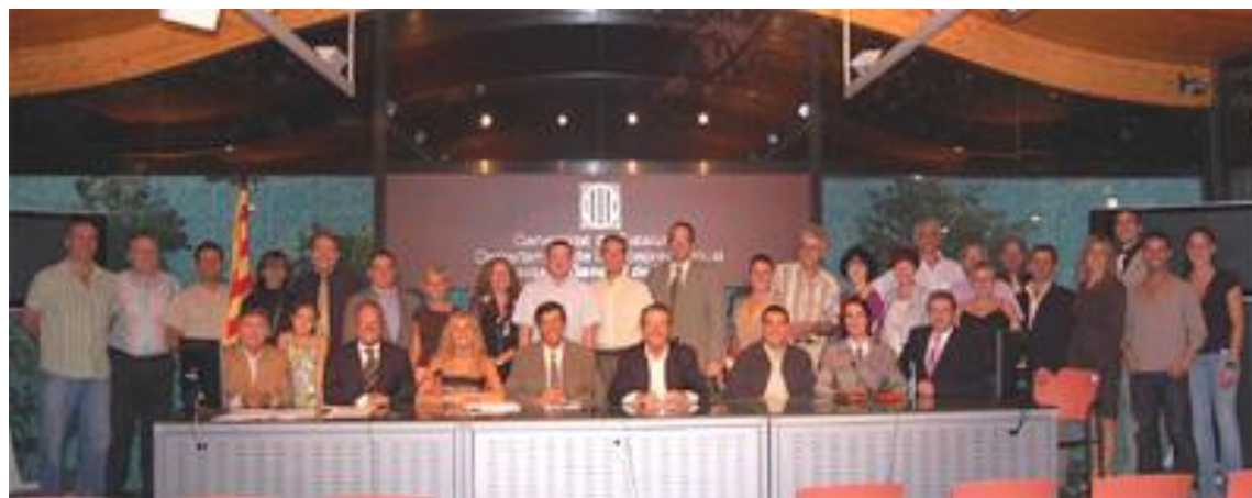
Board of directors and Presidents of the Founders Clubs, the 13 th September in Palau Melcior Colet (Barcelona).