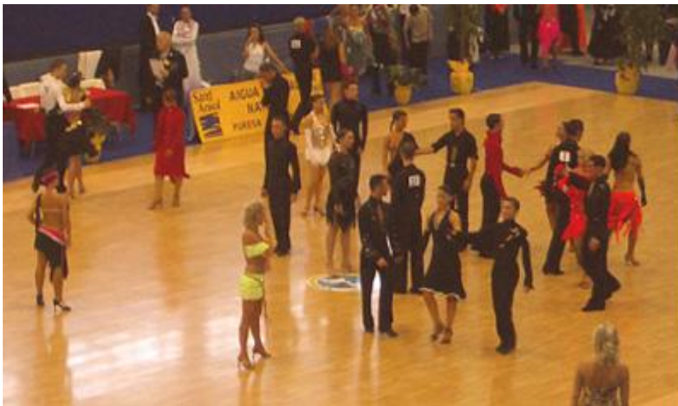
Couples prepared for a competition in Latin dances International Style.